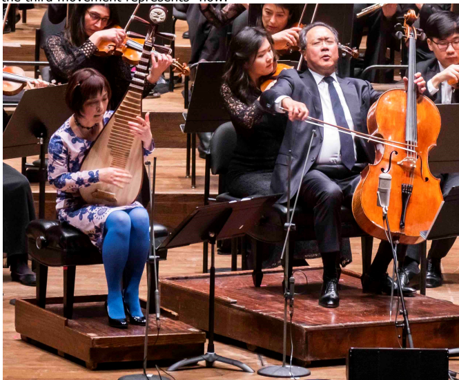
Wu Man and Yo-Yo Ma perform the U.S. premiere of Zhao Lin's Concerto for Pipa, Cello and Orchestra

Thankfully, Zhao Lin's double concerto is a lot less cryptic than that. Cast in three movements, Yo-Yo Ma summed it up neatly in a verbally delivered program note from the stage: the first movement concerns the idea of becoming—what was China before it became China?; the second movement transforms a 200-year-old theme from Zhao Lin's home province, a time and a place of tolerance where temples co-existed with mosques and synagogues; the third movement represents "now."